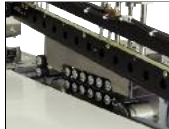
Automatic Film Puller