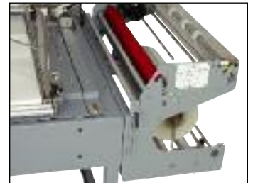
EZ Load Film Unwind