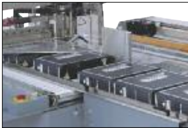
Product Spacing Infeed Conveyor