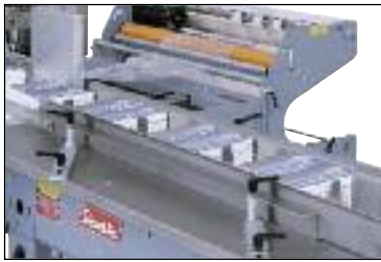
Adjustable Flight Lug Infeed

By selecting just the right combination of options, you can customize your Shanklin A-Series Automatic L-Sealer for the ultimate performance, efficiency and value!