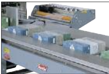
Adjustable Flight Bar Infeed