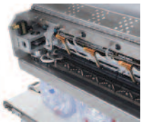
Medical Heat Sealer Optional medical sealer meets stringent sealing requirements of health care packaging