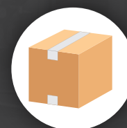
TOP & BOTTOM SEAL